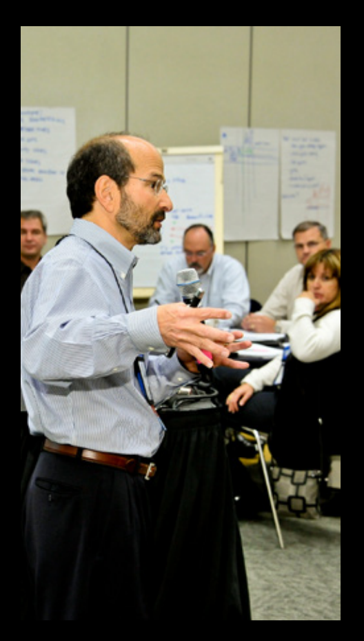
Workshops on topics chosen by you and your fellow consortium members