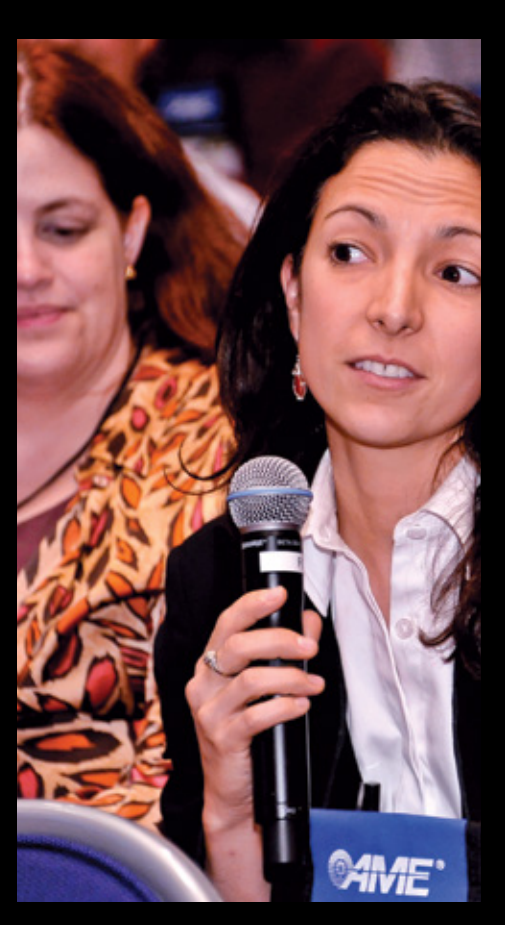
Access to a local network of peers who are also on the lean journey