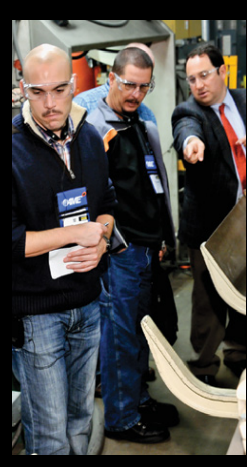
Corporate membership in the Association for Manufacturing Excellence (AME)